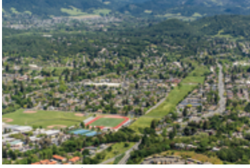
Santa Rosa Southeast Greenway