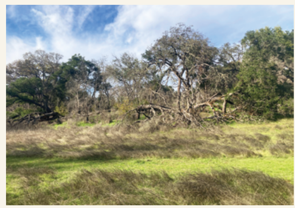
Understory thinning-removing the accumulation of dead plant material and ladder fuels, as shown here-makes the forest more resilient in the event of a wildfire.

So, the California Board of Forestry and key California regulatory agencies