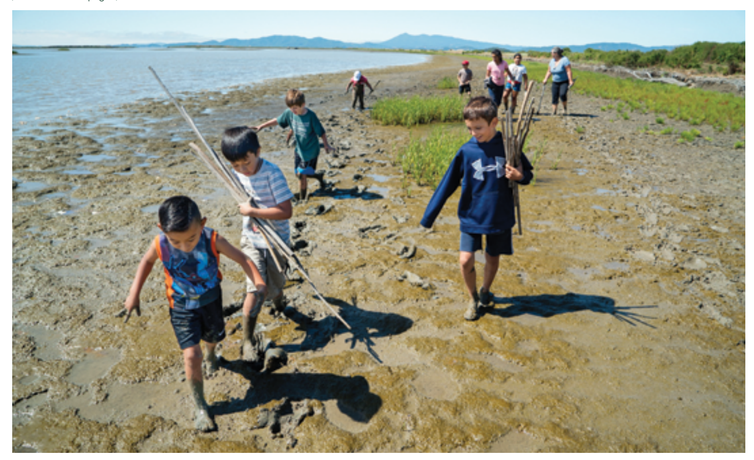
The Land Trust's Bay Camp, a bilingual environmental education summer camp, expands access to nature for the next generation of land stewards.

PROTECT BIODIVERSITY: Biodiversity is essential for ecosystem health and, by extension, the health and wellbeing of our communities. From the San Pablo Baylands, through the Marin Coast-Blue Ridge Critical Linkage and into the Russian River watershed, the Land Trust is acquiring and restoring properties that are crucial for supporting the plants and animals that call Sonoma County home. This includes the stewardship of our 17 preserves using state-of-the-art science.