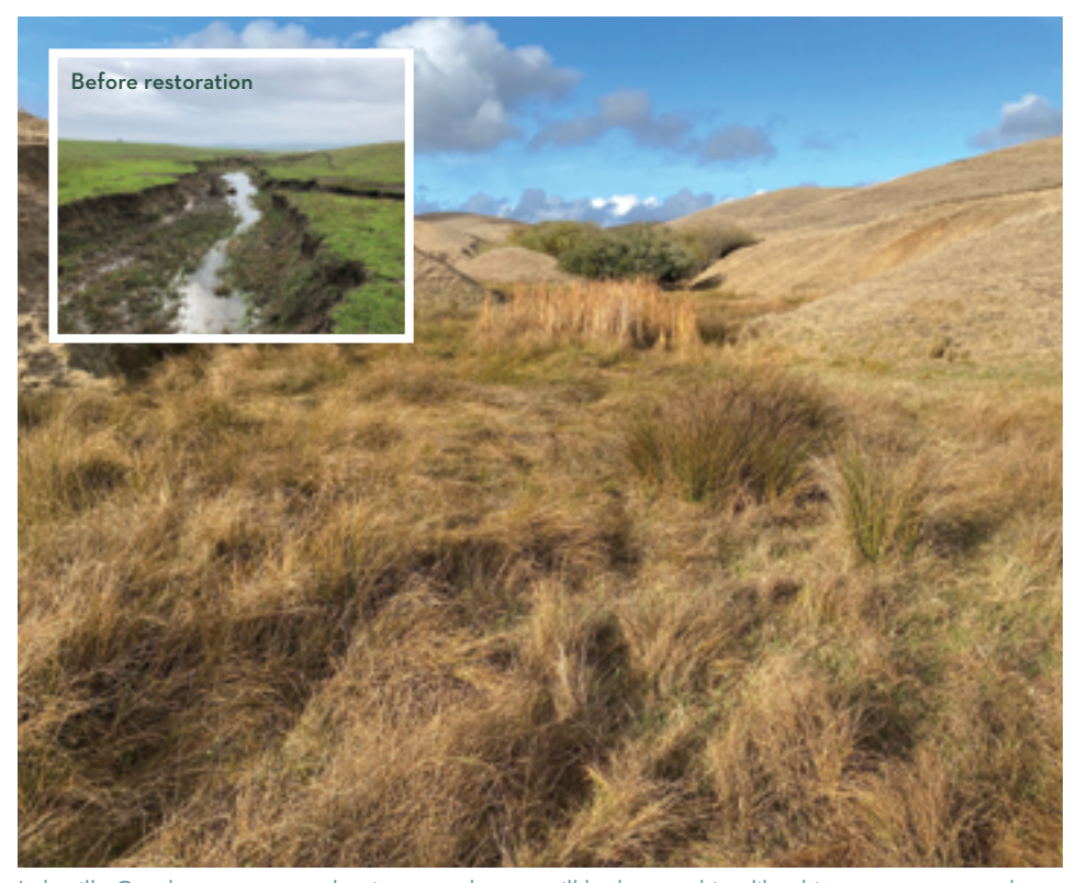
Lakeville Creek, once restored to its natural state, will look something like this grassy, wet meadow.

Today, Lakeville Creek is a deeply eroded, unnatural stream, with streamside vegetation largely absent. Because it is so deeply eroded, it can't overtop its banks and spill onto the floodplain—a process that is critical to healthy streams. It's a familiar look across the Western United States as people have sought to control and confine streams. Once a stream has reached this stage, however, it cannot restore itself. That's where Sonoma Land Trust comes in.