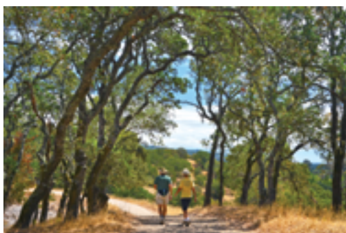
Sonoma Developmental Center