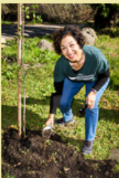
Tree-planting photos by Dale Godfrey